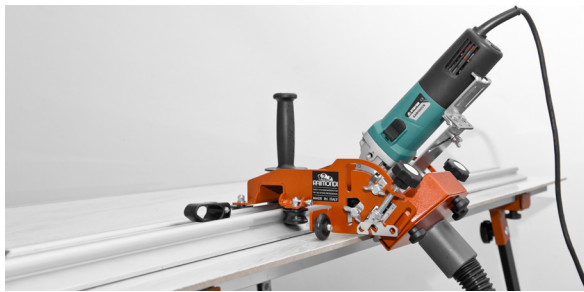
ANGLE CUTTING ON RAIL